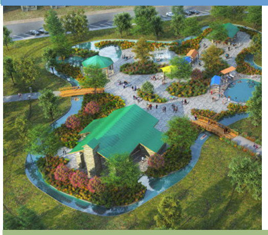
Lazy River Amenity Center Coming Summer 2019!