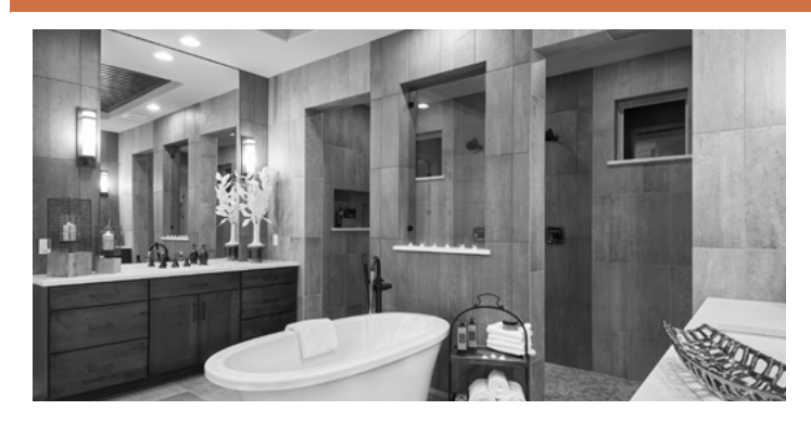
La Ventana is currently one of the most sought-after Hill Country neighborhoods. A meadow filled with longhorn cattle welcomes you into a community offering custom homes on 65 available, secluded 1.5-2.25 acre sites starting in the $600's.